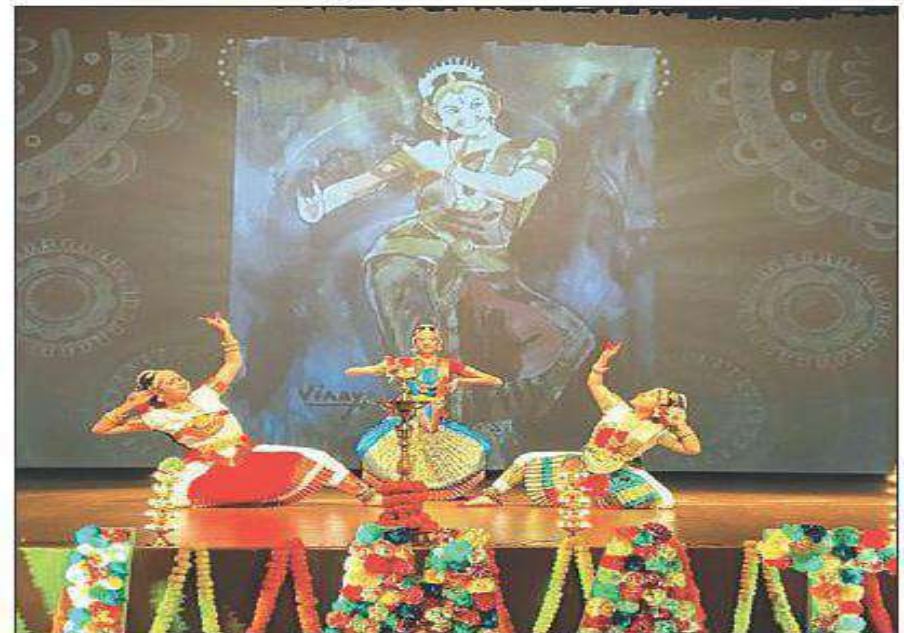
Students performing at the annual event.